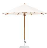
TW TEAKWOOD The elegant masterpiece in precious timber