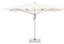
CAS CASTELLO® Pro The versatile allrounder