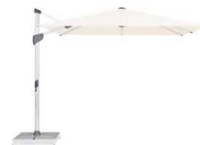
FA FORTANO® The windproof side-mast parasol