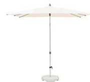
AS ALU-SMART The small and adaptable parasol