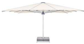
PZR PZN PZS PALAZZO®-Line Royal, Noblesse, Style