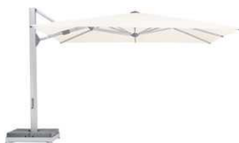
AMB AMBIENTE Nova The queen of the side-mast parasols