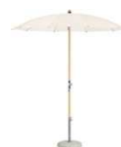
AL ALEXO® The classic parasol since 1931