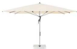
FL FR FI F-Line Fortello®, Fortero®, Fortino® Riviera