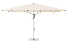
FL FR FI F-Line Fortello®, Fortero®, Fortino® Riviera