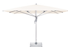
CAS CASTELLO®Pro The versatile allrounder