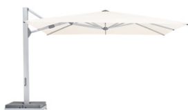
AMB AMBIENTE Nova The queen of the side-mast parasols