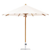
TW TEAKWOOD The elegant masterpiece in precious timber