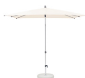
AS ALU-SMART The small and adaptable parasol