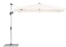
FA FORTANO® The windproof side-mast parasol