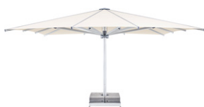
PZR PZN PZS PALAZZO®-Line Royal, Noblesse, Style