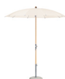
AL ALEXO® The classic parasol since 1931